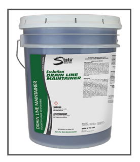
Ecolution<sup>®</sup> Drain Line Maintainer Bacterial Lift Station Maintainer