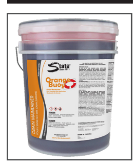
Orange Buoy™ Floating Degreaser and Deodorizer