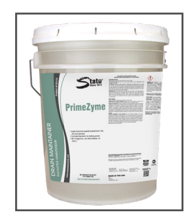
PrimeZyme <sup>™</sup> Liquid Bacterial Enzyme Treatment